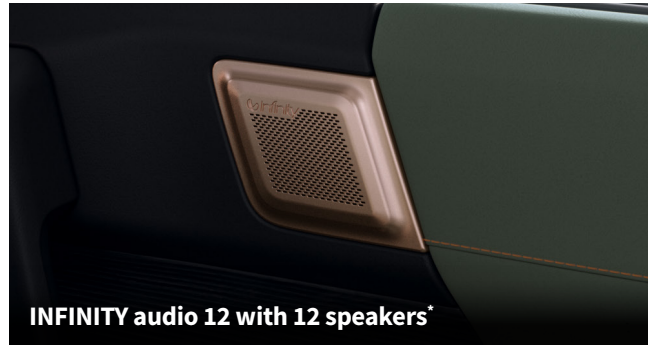
INFINITY audio 12 with 12 speakers*