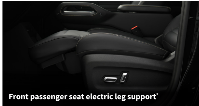
Front passenger seat electric leg support*