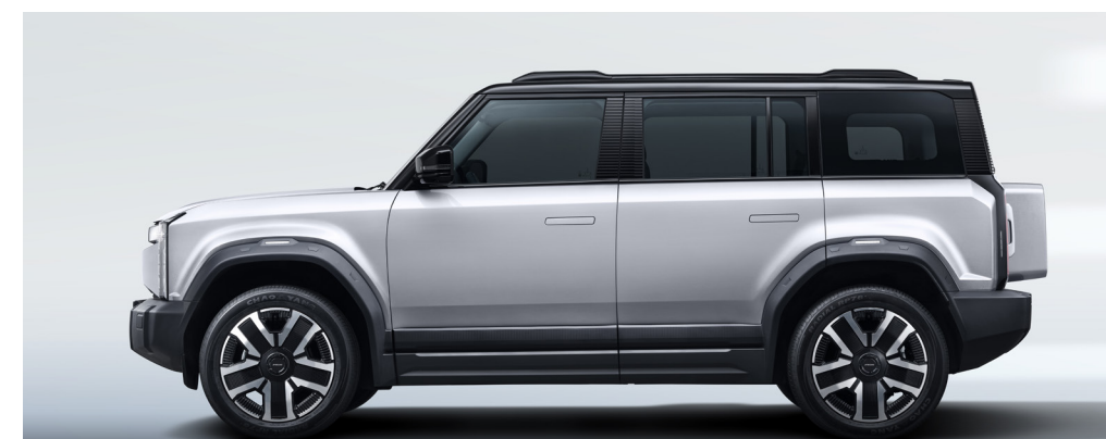
The exterior design, with its short front and rear overhangs, provides high agility for off-road driving