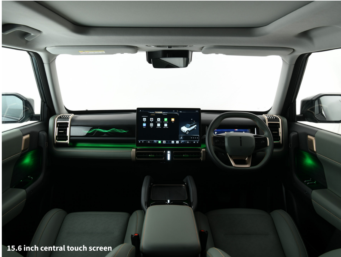
15.6 inch central touch screen