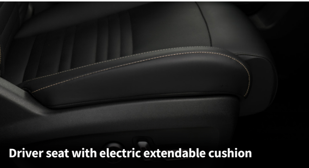
Driver seat with electric extendable cushion