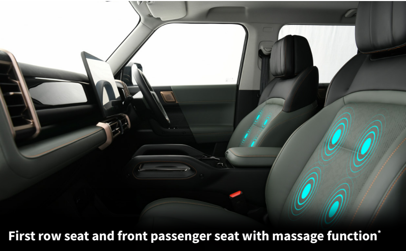
First row seat and front passenger seat with massage function*

Chery EJ6 combines cutting-edge technology with first-class comfort features. It includes a driver seat 6-way power adjustment with memory, electric leg support* and a seat with massage function* for front passenger, all designed to elevate the driving experience on any journey.