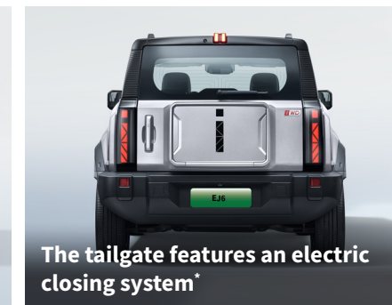
The tailgate features an electric closing system*

Remarks : 1. The company reserves the right to change the models, technical specifications, systems, and both interior and exterior equipment at any time without prior notice. 2. Images and colors shown in the document may differ from the actual products. *Available only in the 4WD model.